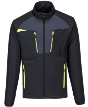
DX480 17 DX4 ZIP BASE LAYER