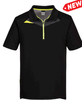
DX410 22 DX4 POLO SHIRT S/S