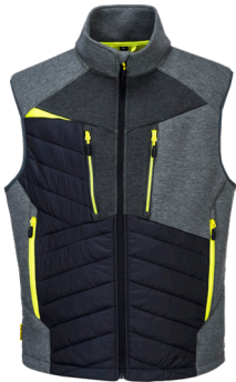
DX470 16 DX4 HYBRID BAFFLE GILET