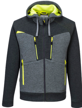
DX472 17 DX4 ZIPPED HOODIE