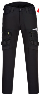
DX443 20 DX4 SERVICE TROUSER