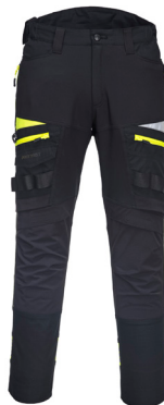
DX449 19 DX4 WORK TROUSER