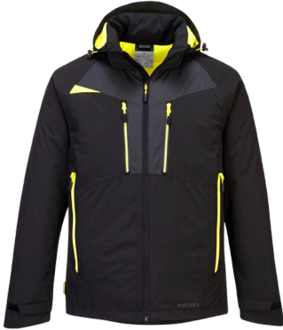
DX460 14 DX4 WINTER JACKET