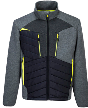
DX471 16 DX4 HYBRID BAFFLE JACKET