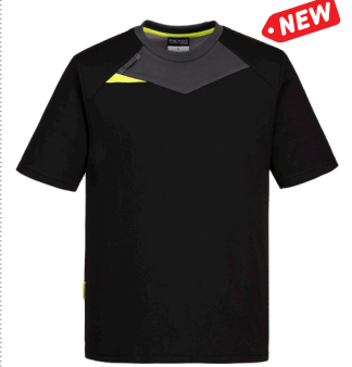
DX411 22 DX4 T-SHIRT S/S