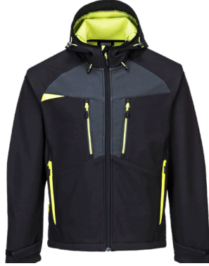
DX474 15 DX4 SOFTSHELL JACKET (3L)