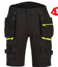
DX444 19 DX4 HOLSTER SHORTS