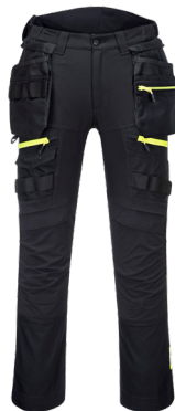
DX440 18 DX4 DETACHABLE HOLSTER POCKET TROUSER