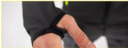
THUMB HOLE FOR SECURE FIT

92% Nylon, 8% Elastane, 210g Black S-3XL, Metro Blue S-3XL