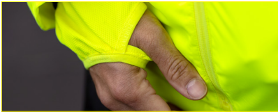
THUMB HOLE FOR SECURE FIT